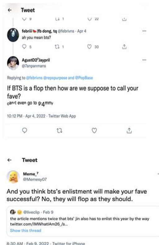
Figure 1. The figure above portrays how ARMY underestimates other artists.

their idols but also the fandom begins to act aggressively toward other fandoms on Twitter. On top of that, there are also circumstances where ARMY acts aggressively toward other fellow entertainers as well. These two examples of fandom behaviors are prime examples of fanaticism as the fandom expresses their support in an extreme enthusiasm and devotion that leads to aggressive behaviors (Eliani et al., 2018, 62-63). These aggressive behaviors that are shown by ARMY on Twitter result in the label of toxic fandom as given by other Twitter users. For instance, there are various circumstances where ARMY is seen underestimating as well as badmouthing other artists and fandoms.