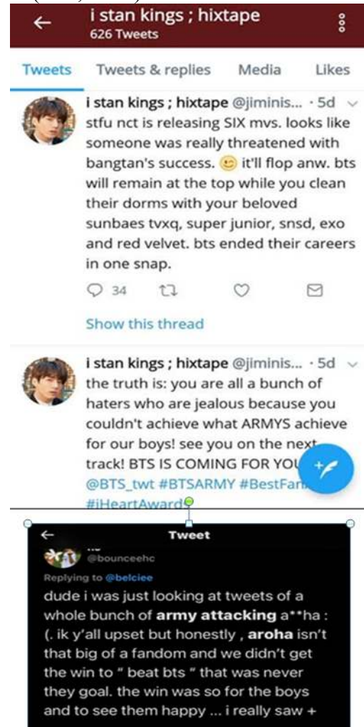
Figure 2. The figures above show ARMY's toxic behavior by attacking other fandoms.

feelings such as concern and care toward BTS (Gao, 2022).